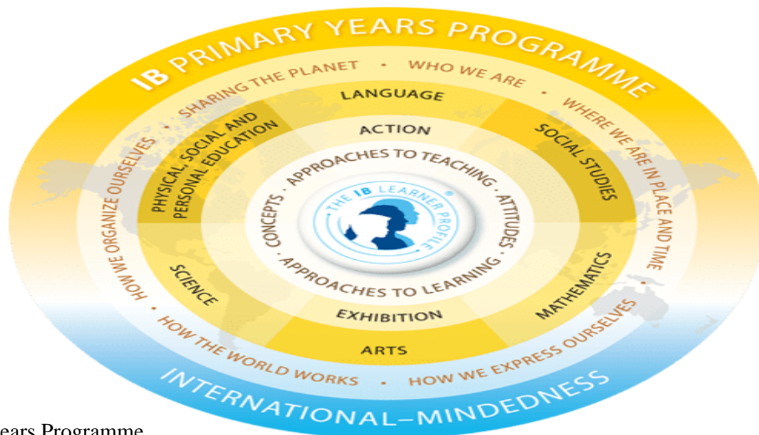
The IB Primary Years Programme

The IB Primary Years Programme (PYP) for children aged 3-12 (TD II- Grade 5) nurtures and develops young students as caring, active participants in a lifelong journey of learning.